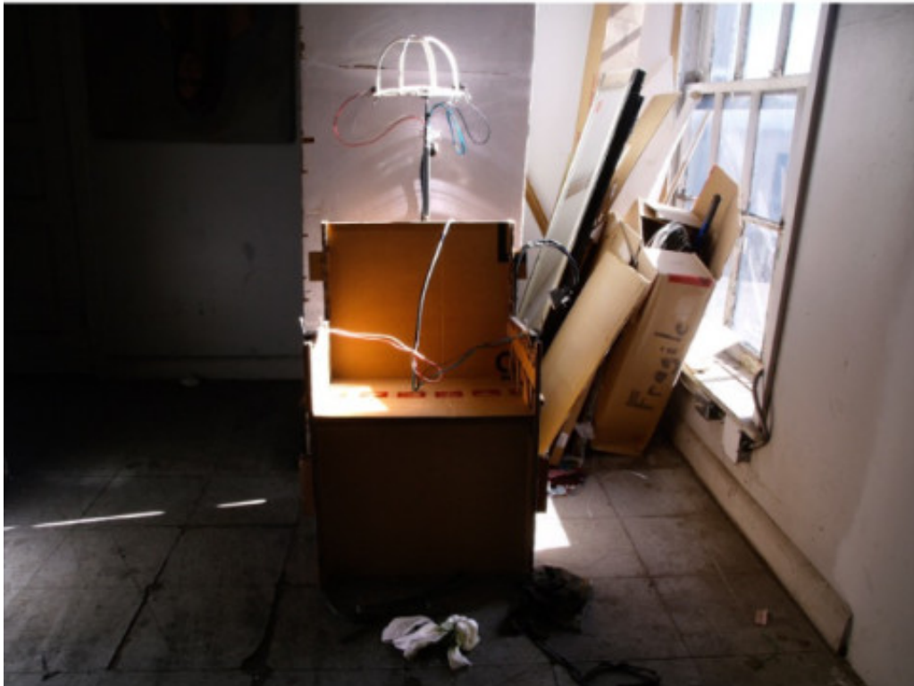
Pairing # 22, 2014 Archival inkjet print / 4.5" x 6" - each image Edition of 7