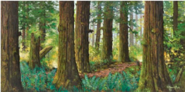
KAREL DORUYTER, Are You O.K. , Acrylic on Canvas, 36 x 72"